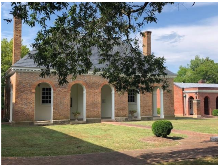
At the King William County Courthouse Green

We look forward to our next meeting for 2020 on Sunday, October 18, 2:30 p.m.