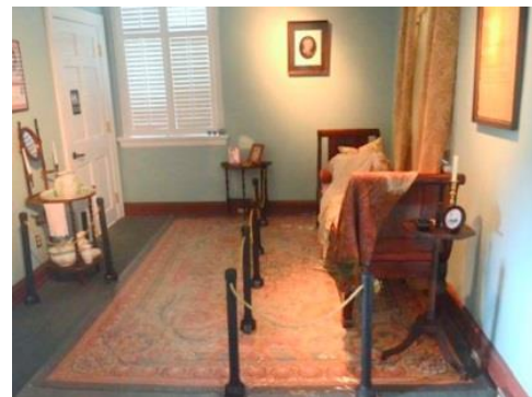
Exhibit in the Museum

To do any of the following: Tour Guide and Hosting (please consider), Data Research and Entry, and Exhibit Planning and Care, call 804-769-9619 to volunteer.