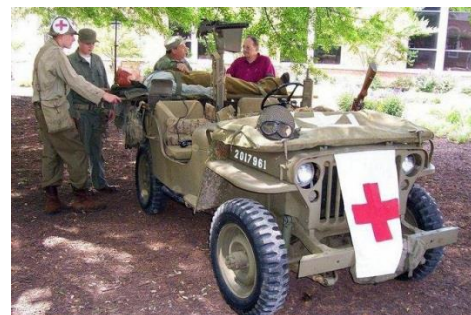
Part of military display at Tools of Freedom

On November 9 th and 10 th there will be a display of modern war artifacts from World War 1 to the Viet Nam Conflict on the Courthouse grounds and the common green. This unique presentation known as "Tools of Freedom" will be open to the public on Saturday, November 9 th , from 10:00 AM until 5:00 PM and on Sunday, November 10 th from 1:00 PM until 5:00 PM. There will be reenactments as well as exhibits of military equipment, weapons from each era, vehicles and even military field hospital tents. This is a great opportunity to honor our veterans. Be sure to visit.